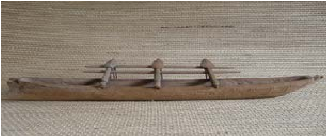
Figure 2: A Samoan canoe of the 1920s 51

Samoaian islands—and they had a chance to give their new space names. An examination of Samoa’s naming system indicates that people’s names and those of their villages reflect those of their founders and/or some of their deeds. Sāolufata, for example, was named after its founder, Luafatā’alae. ‘Upolu was named after the couple ‘U and Polu who discovered it. 48 The title ‘Aumua derived from the legend of Fiti’a’aumua, the Tui Manu’a who ruled the Polynesian kingdom from Manu’a. 49 Brother Henry, however, claims that the identity of Sāmoa originated at the beginning of the Tongan occupation circa 900 C.E. and that each island had its own name and its own paramount chief. 50