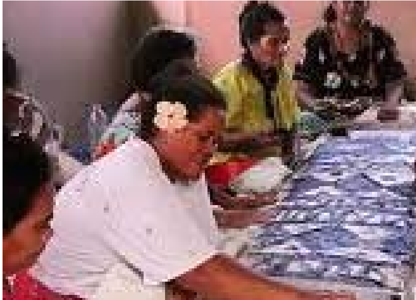
Figure 10. 'Elei Printing

favor 'elei prints as uniform in both Samoas. 68 It is therefore a rare scene in Apia to see a Samoan worker in a skirt and top; the woman's postcolonial body is clothed in 'elei printed puletasi while the men wear plain 'ie faitaga , pocket lavalava , and printed shirts.