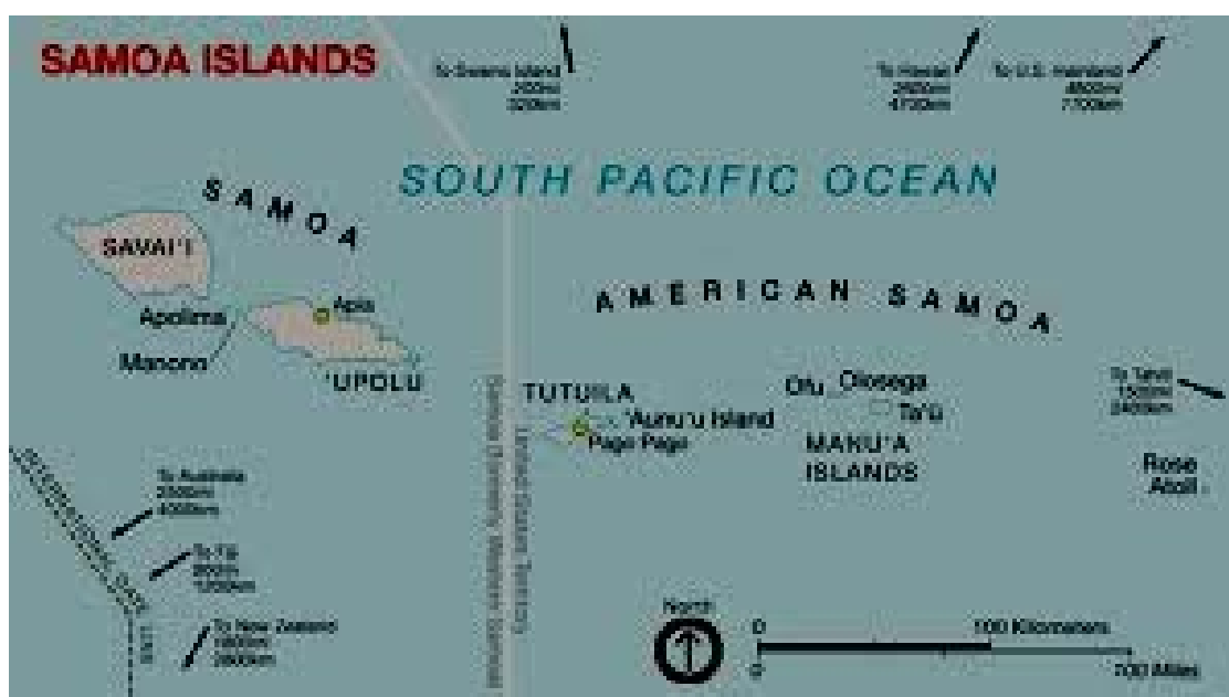
Figure 1. The Samoan Islands. Note: Western Sāmoa changed its name to Sāmoa in 1997. 15

The Samoan islands have been described as mostly volcanic in nature and lying between approximately 13° and 15° south latitude and 168° and 173° west longitude. Within these tropical parallels, the islands are hot and humid between the months of November and March, and relatively cool and dry between April and October. 'Upolu and Savai'i islands are protected