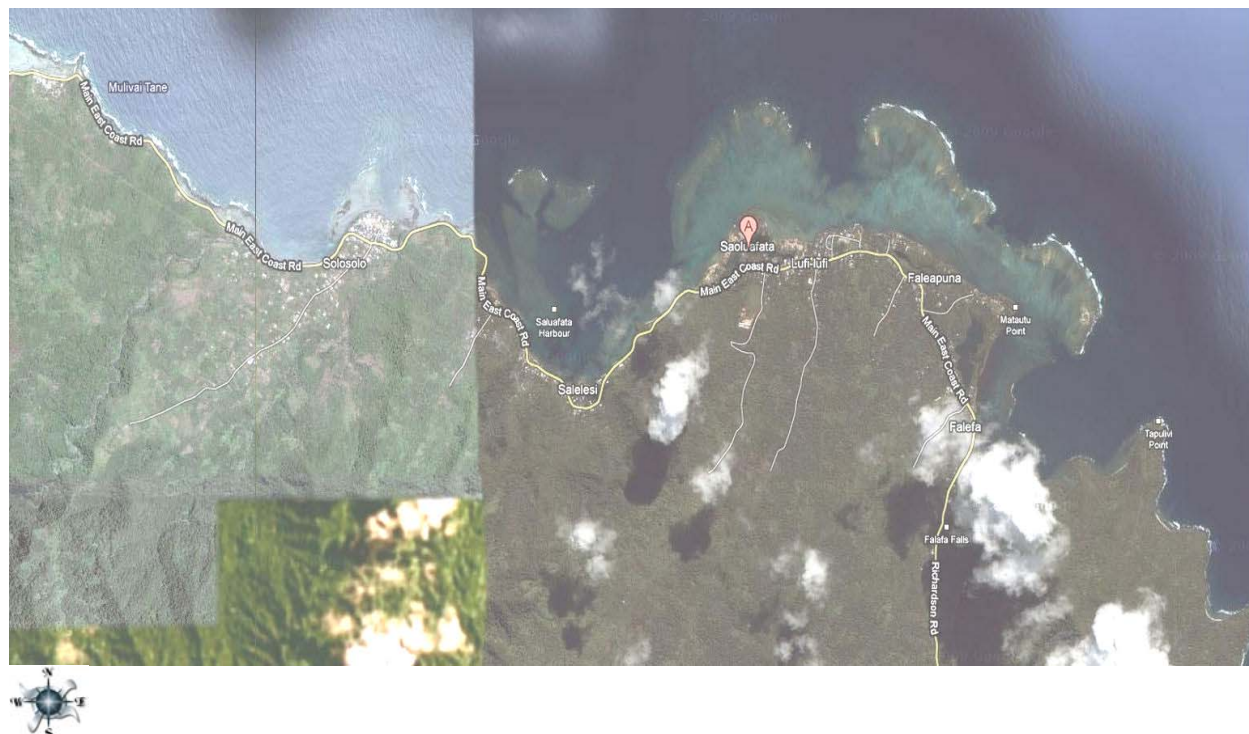
Figure 5: Imagine this map without the main road and names. The whole area from the promontory Utusi'a on the right to the lighter area on the left was known as Evaloa. Circa mid-1300 C.E., the cape was settled by Luafatā'alae and her heirs.

thatched roofs. At the time, the only palagi-styled, Europeanized structures belonged to our family and to Tagaloa Siaosi Kerslake, one of the paramount chiefs. 121 Since then, every family dwelling includes mixed architecture with most houses made of imported materials like concrete, tin panels, glass louvers, and nails. Even cooking structures have concrete floors and tin roofs