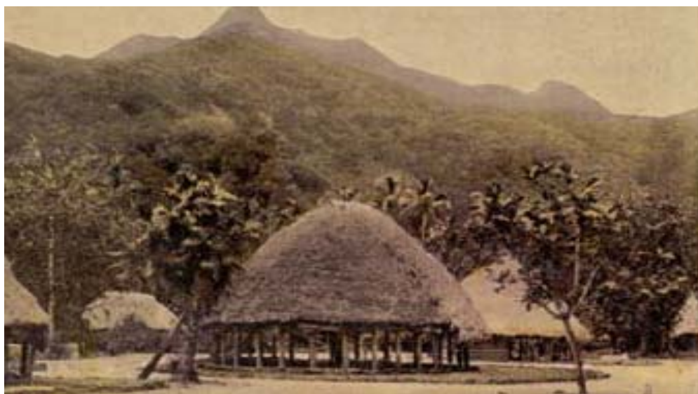
Figure 3: A maota, high chief's guest house in Pago Pago, 1894 53

Each pui'āiga , immediate family, was headed by the father, who, as head of household, was given a chiefly title to symbolize and remember an event or a role performed impressively by the recipient. He ordered his meeting house built in the dome shape of the sky, propped up by a single post in the center and by a circle of posts at the rim. Tagaloa-a-lagi, supreme God and father of the Samoan race, thatched his house with red feathers and called it, the Fale'ula . Under the post was a magālafu , fire pit, housing live embers which were revived into flames during prayer. Such flames were known as fanaafi o fa'amalama . 52 Men, women, and children were ranked and placed in groups. Heads of households met periodically or whenever the need arose to decide how to keep the village fed and safe in anticipation of famines and invasions.