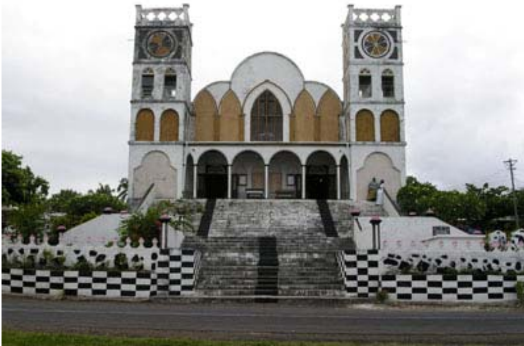
Figure 11. Church at Sapapāli'i, the village where John Williams dropped anchor during his first voyage to Sāmoa in August 1830.