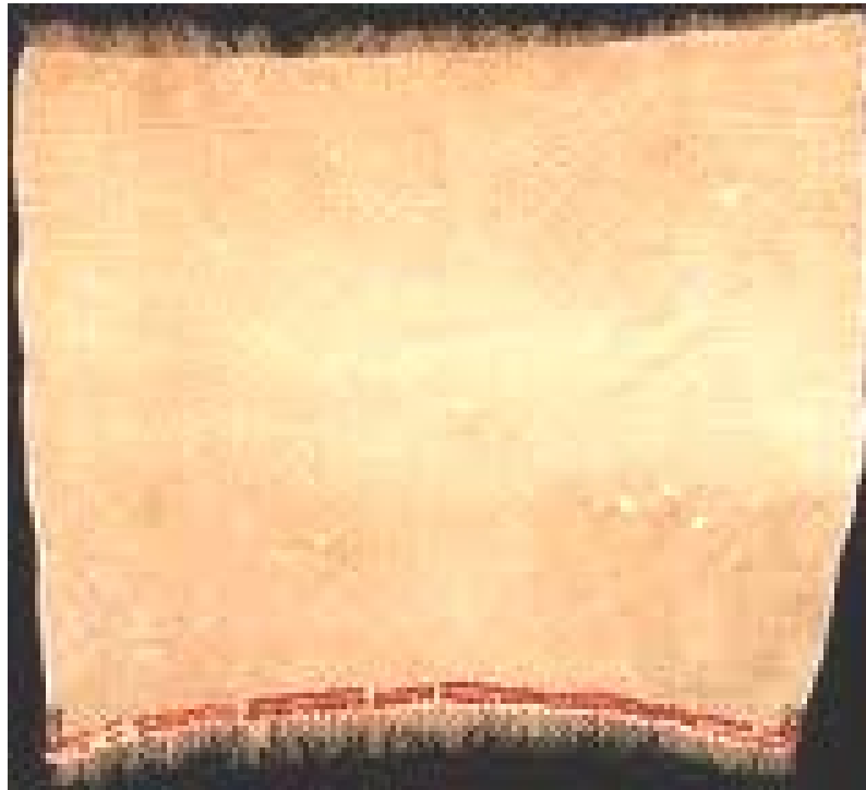
Figure 8. 'Ietoga, Fine Mat of Old Samoa