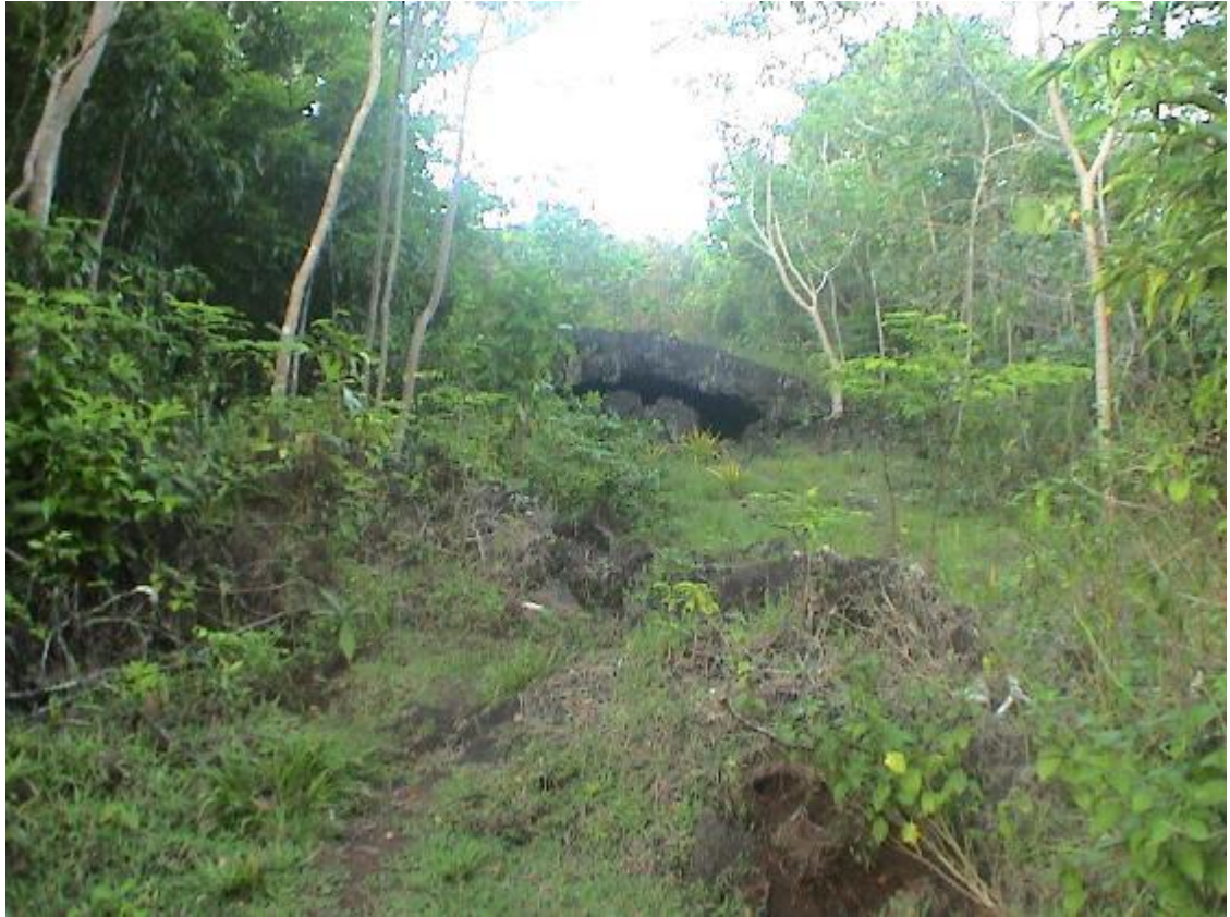
Figure 9. The entrance to the Cave at Faleālupo where the Teine won the thatching competition in the Vavau.

women would take just a day to do the job; unfortunately, by sunset, only one half of the roof was covered and that was the side thatched by the auluma . The chief was apparently so upset with the men that he cursed the house and turned it to stone. Figure 9 above is a current view of the spot at Faleālupo where the thatching competition purportedly took place.