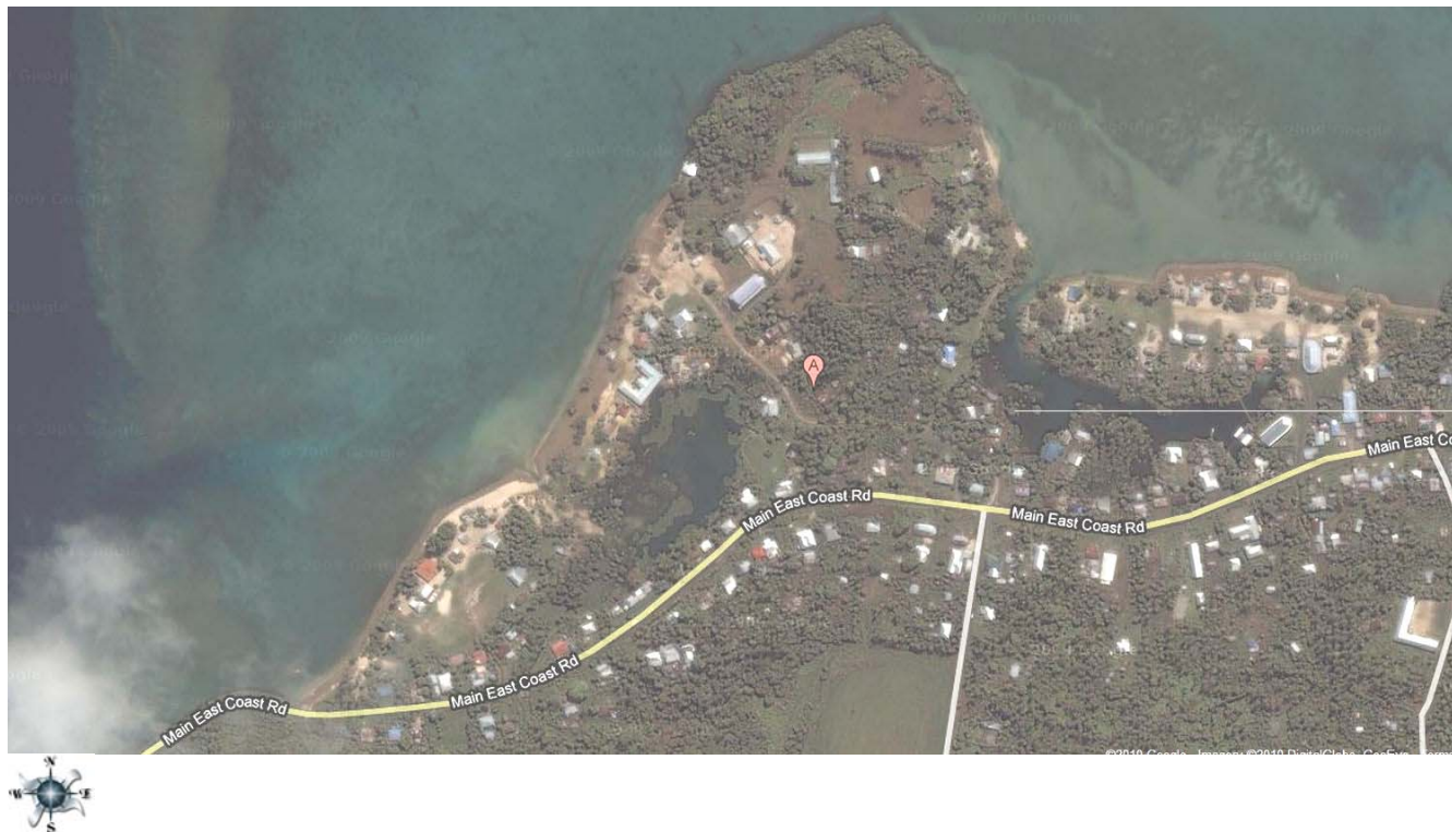
Figure 4: Satellite view of Sāoluafata village from Saoluafata Bay (known to the villagers as Faga'ese Bay) on the west to the village proper running north along Cape Utusi'a through which snakes the Main East Coast Road. The village spans the contours of the cape and is separated on the eastern side from the village of Lufilufi by a smaller bay known as Mulinu'ū and towards the mainland cutting south to the first road adjacent to the main one. My family residence is the fourth house from the bottom left hand corner of the map and immediately after a rectangular clearing ending at the road. 116 Google Maps, http://maps.google.com/maps .

garbage disposal for a different destination. This was a common practice before the advent of modern communication and transportation. Tupua claims in the above quote that the pute